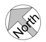
Site - Proposed Block Plan 1 : 500

TACP Architects Ltd Pembroke House Ellice Way, Wrexham Technology Park, Wrexham, LL13 7YT 01978 291161 admin@tacparchitects.co.uk www.tacparchitects.co.uk